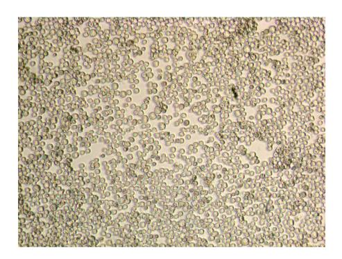
SP2/0-Ag-14 in Panserin H4000

The formulation of the protein-free Panserin H4000 with a low concentration of plant hydrolysates enables a high cell yield in combination with excellent production rates of monoclonal antibodies. The ready to use protein-free medium allows easy handling and therefore reduces contamination risks and ensures a simple and economic purification of the final products in downstream processes.